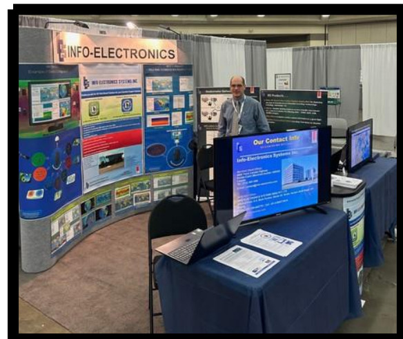
IES booth at the American Meteorological Services conference in Baltimore, Maryland in January 2024