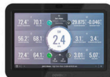
Shown here: Wireless Vantage Vue with console

Vantage Vue, is a fixed or portable all-in-one weather station that offers professionals and weather enthusiasts an affordable performance package. You will get your own local forecast, highs/lows, totals or averages and graphs for virtually all-weather variables over the past 24 days, months or years—all without using a PC. Vantage Vue stations are an excellent choice for storm chasers, weather enthusiasts, farmers, schools, gardeners, recreation and many others who want to monitor their local weather environment.