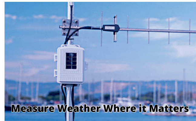
Measure Weather Where it Matters

Based in Hayward, California, Davis Instruments part of the AEM family is a privately held manufacturer and developer of exceptional weather, and marine instruments. Davis Instruments prides itself on innovation and high-quality, user friendly products at reasonable prices for everyone from casual weather watchers to experienced research scientists.