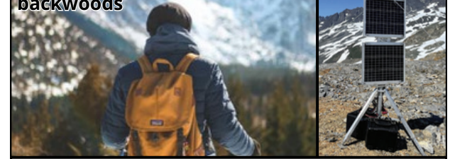
Vantage Pro2 with Nupoint Systems Camera - Northern B.C

Stay connected to your data no matter if it's from your backyard, the farm, or the backwoods